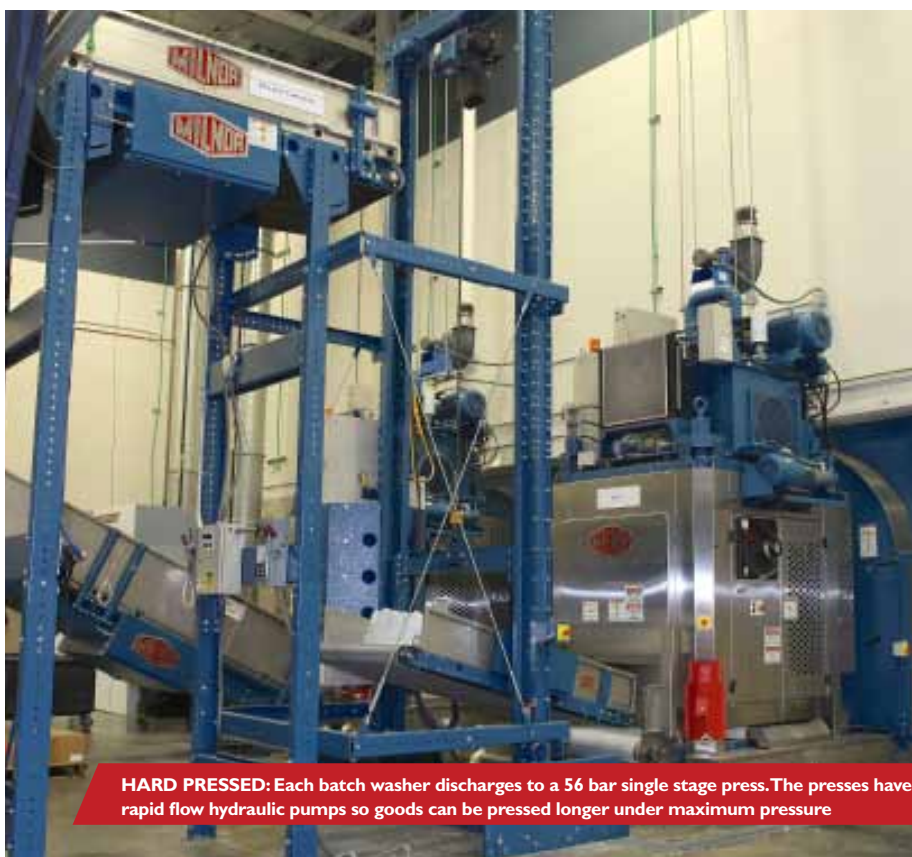
HARD PRESSED: Each batch washer discharges to a 56 bar single stage press. The presses have rapid flow hydraulic pumps so goods can be pressed longer under maximum pressure