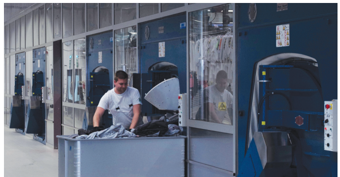
RAISING PRODUCTIVITY: DBL Kuntze & Burgheim's Hermsdorf site expects to double its production from 40,000 pieces of workwear per week in one daily shift

These machines are equipped with the latest Milnor MilTouch-EX™ control, which has been integrated with the laundry's established Mildata® network.