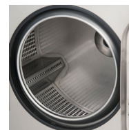
Superior cylinder design

P.O. Box 400, Kenner, LA 70063 • t: 504-467-9591 • milnorinfo@milnor.com