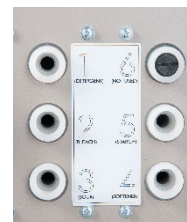
Safe chemical injection