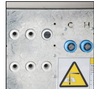
Safe chemical injection