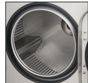
Superior cylinder design