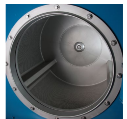
Superior cylinder design