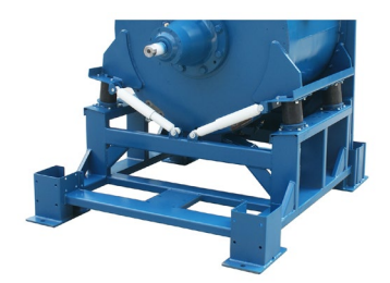
SmoothCoil™ 4 Point Suspension System