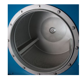
Superior cylinder design