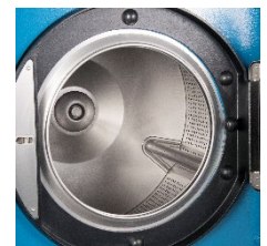
Superior cylinder design