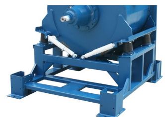
SmoothCoil™ 4 Point Suspension System

Contact Milnor for your local, authorized dealer: