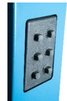
Safe chemical injection

BENEFIT: Faster repairs mean less downtime. Superior product support through local, highly-skilled dealers.