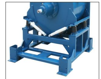
SmoothCoil™ 4 Point Suspension System

Contact Milnor for your local, authorized dealer: