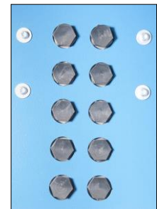
Safe chemical injection