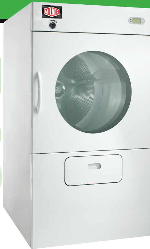
M76ED OPL Dryer