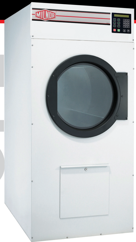
M50V OPL Dryer