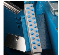
Safe chemical injection

BENEFIT: Faster repairs mean less downtime. Superior product support through local, highly-skilled dealers.