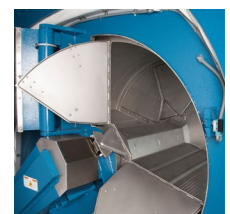
Superior cylinder design

Contact Milnor for your local, authorized dealer: