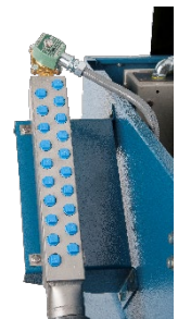
Safe chemical injection

BENEFIT: Faster repairs mean less downtime. Superior product support through local, highly-skilled dealers.