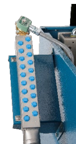
Safe chemical injection

BENEFIT: Faster repairs mean less downtime. Superior product support through local, highly-skilled dealers.