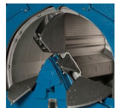
Superior cylinder design

Contact Milnor for your local, authorized dealer: