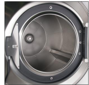
Superior cylinder design