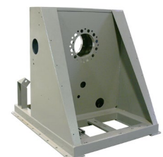
Solid industrial frame

Contact Milnor for your local, authorized dealer: