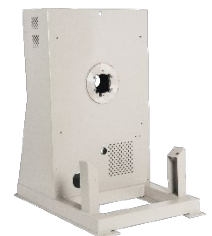
Solid industrial frame

Contact Milnor for your local, authorized dealer: