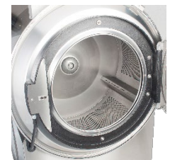
Superior cylinder design

BENEFIT: Faster repairs mean less downtime. Superior product support through local, highly-skilled dealers.