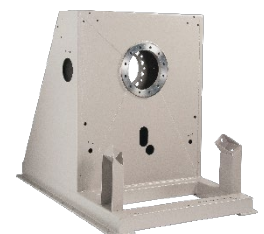
Solid industrial frame

Contact Milnor for your local, authorized dealer: