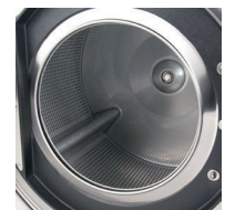
Superior cylinder design

BENEFIT: Faster repairs mean less downtime. Superior product support through local, highly-skilled dealers.