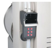
Safe chemical injection