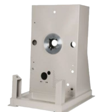
Solid industrial frame

Contact Milnor for your local, authorized dealer: