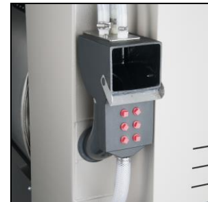
Safe chemical injection