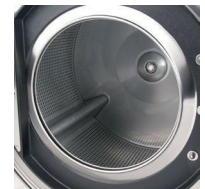
Superior cylinder design

BENEFIT: Faster repairs mean less downtime. Superior product support through local, skilled dealers.