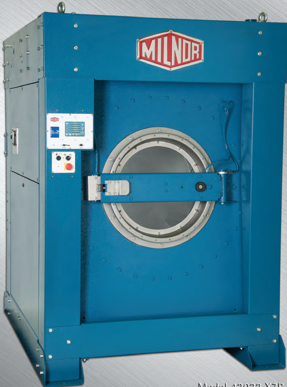
Model 42032 X7R

CONTROLS VIBRATION • HIGH G-FORCE EXTRACTION • FOUR CAPACITIES