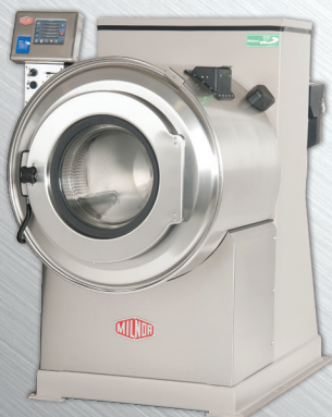
Rigid-mount machines with the MilTouch control are a cost-effective wetcleaning solution for many businesses.

Milnor's superior cylinder design and tall, lifting ribs yield greater wash/rinse quality while delicately processing goods.