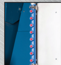
Optional signals for up to 12 chemicals allow these units to accommodate a wide variety of formulas and process a broad range of goods.