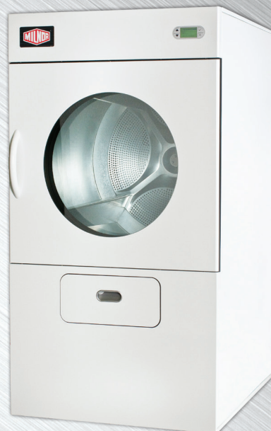
Dryers equipped with residual moisture control (RMC) can carefully remove moisture from delicate items, preserving many fabrics.