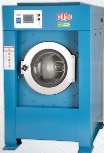
Soft-mount machines with the MilTouch control have vibration control systems that allow installation in a wide variety of locations.