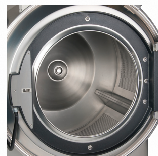
36026 cylinder shown

Milnor's tall rib construction and precise cylinder speeds combine to provide excellent MAF – Mechanical Action Factor – delivering excellent wash quality and reducing time-consuming and costly rewashes.