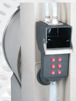
30022VRJ chemical inlet shown

Chemicals are injected in the rear of the machine (unlike certain brands where chemicals are injected near the front of the machine at eyelevel). Chemicals are diluted and flushed into the sump of the washer-extractor so that raw chemical does not come in direct contact with the linen or the stainless steel.