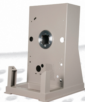
30022VRJ frame shown

Milnor frames are designed to prevent concentration of stress in one spot and all structural components are tied together for optimum stress dispersion. This proven structural integrity means your machines will last longer.