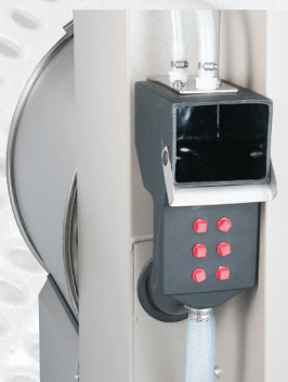
30022VRJ chemical inlet shown

Chemicals are injected in the rear of the machine (unlike certain brands where chemicals are injected near the front of the machine at eyelevel). Chemicals are diluted and flushed into the sump of the washer-extractor so that raw chemical does not come in direct contact with the linen or the stainless steel.