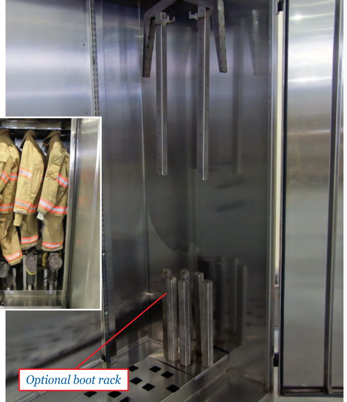
Optional boot rack

Insertion air tubes allow heated airflow to penetrate into the hanging jackets and bibs, providing superior drying performance. An optional boot rack can be inserted as tubes into the bib leg to increase directed airflow into the gear and speed drying time.