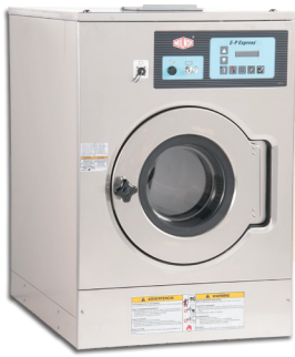
MWT16X5 with E-P Express® control

Milnor's value-priced cabinet-style washer-extractors range in capacity from 25-80 lb. (12-36 kg). Available in three controls, these machines offer savings and flexibility—without compromising the wash quality you expect from a Milnor.