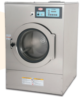
MWR36J4 with E-P Plus® control

Milnor's value-priced cabinet-style washer-extractors range in capacity from 25-80 lb. (12-36 kg). Available in three controls, these machines offer savings and flexibility—without compromising the wash quality you expect from a Milnor.